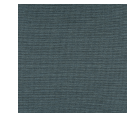
945-58 - Jewel