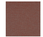
945-40 - Ladybug