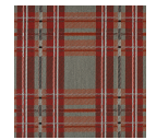
904-44 - Dress McDonald