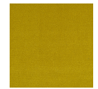
977-63 - Acid