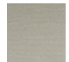
977-80 - Paper Mache