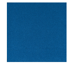
977-55 - Watercolor