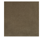
977-37 - Craft Paper