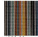
1082-62 - Turquoise Agate