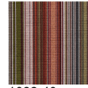
1082-40 - Rose Agate