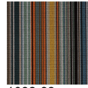
1082-62 - Turquoise Agate