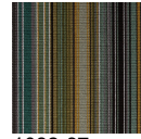
1082-67 - Emerald Agate