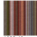
1082-40 - Rose Agate