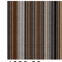
1082-23 - Shadow Agate